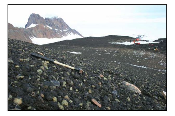
Mantle xenoliths (greenish rocks in foreground) at Overton Peak, Rothschild Island