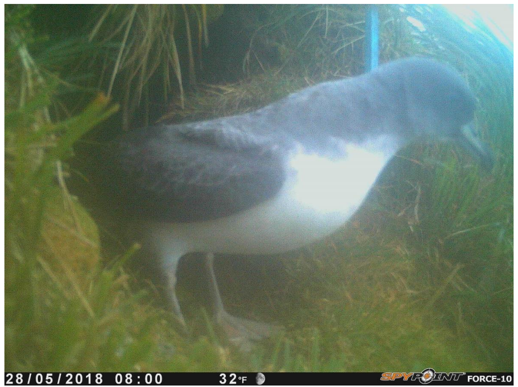
Figure 2: Rarely Grey Petrels emerge from their burrows during daylight.