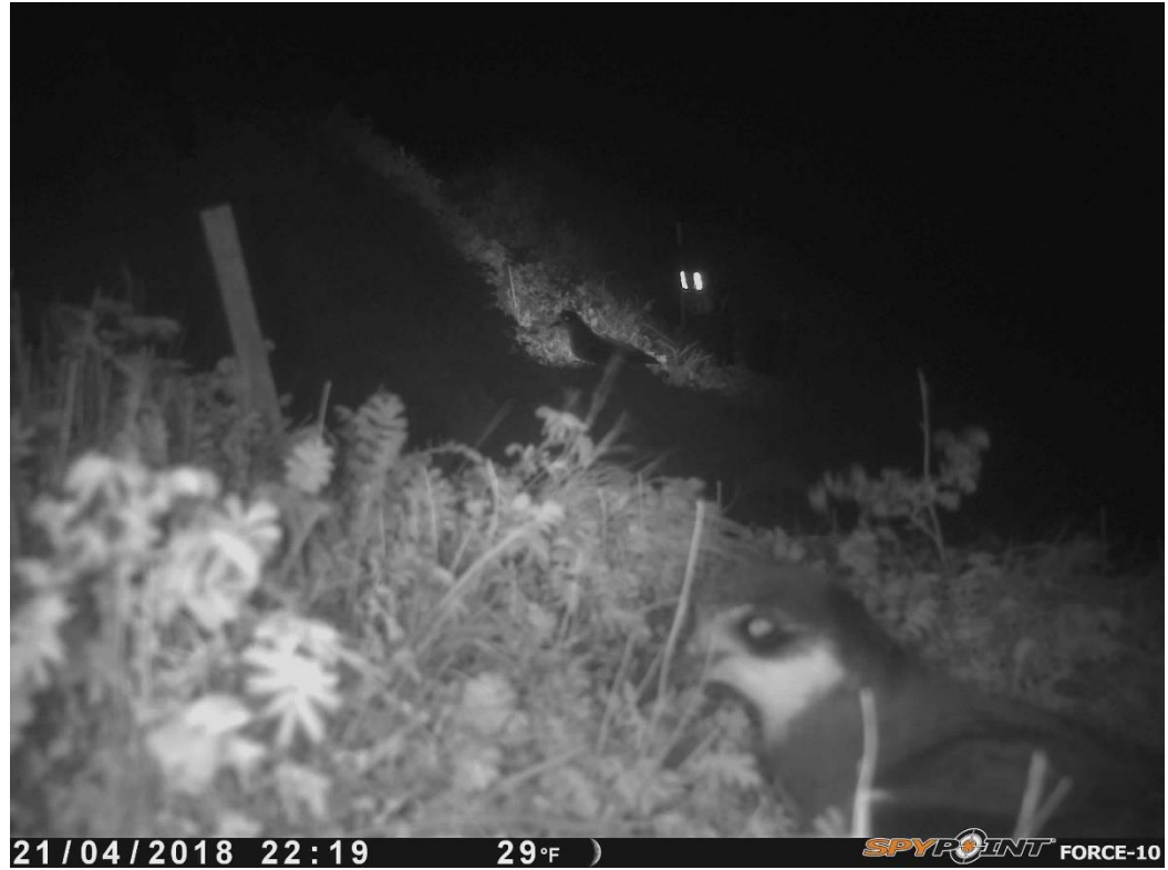
Figure 1: A Blue Petrel returning to its burrow while a second bird is triggering the camera outside its burrow, elsewhere in the colony.