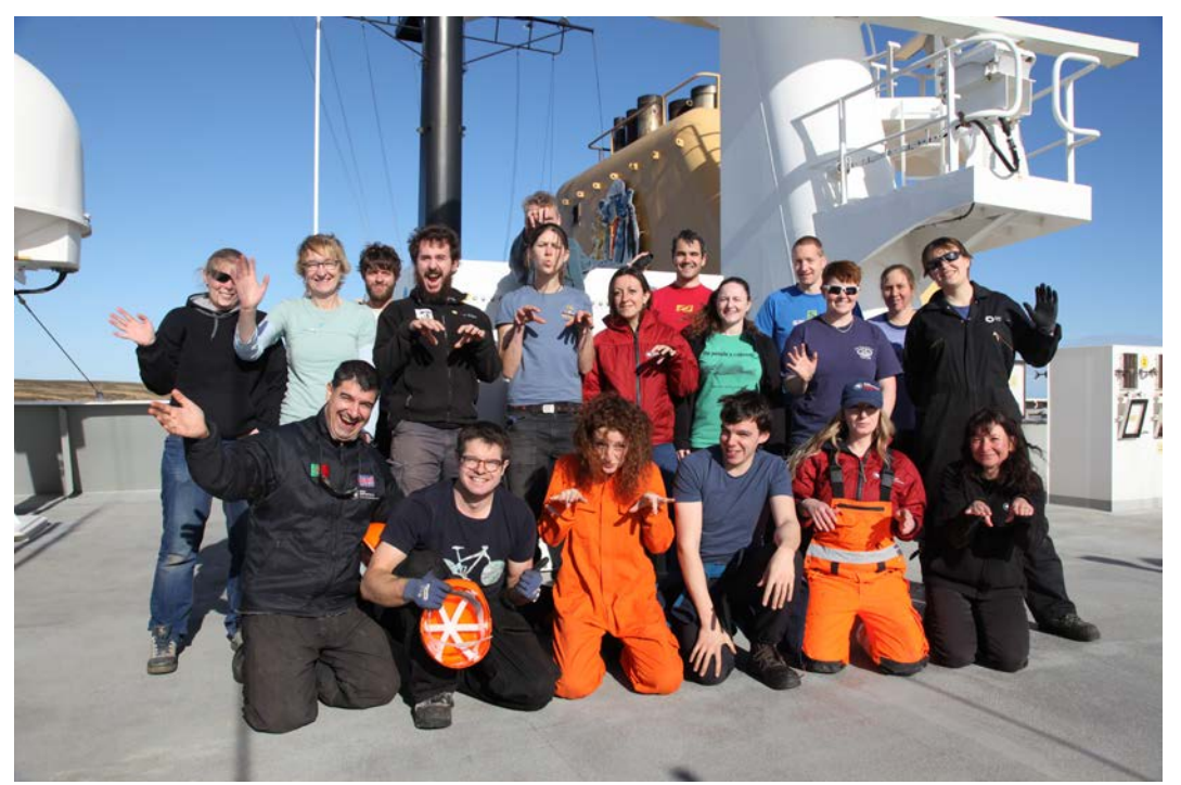
Figure 2: Team science on research cruise JR19001: Spot those doing their best impression of krill

Analysis of the field data has advanced and a manuscript is currently in draft for submission to Antarctic Science. The results represent the first step towards being able to detect krill remotely, and also highlight some of the hurdles that remain to be tackled. Obtaining clear satellite imagery in the Southern Ocean is a challenge due to cloud cover, particularly to match field sampling. We suggest the need for further studies, combining targeted surface sampling for krill with UAV surveys, in the hope to allow collection of true field reflectance (i.e. without possible interference from the lab environment) and to ground truth these data.